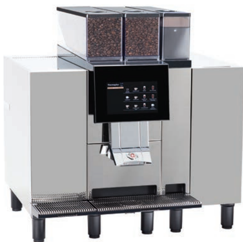
B&W4c CTM P F RS

California residents see Prop 65 Warning on page 1