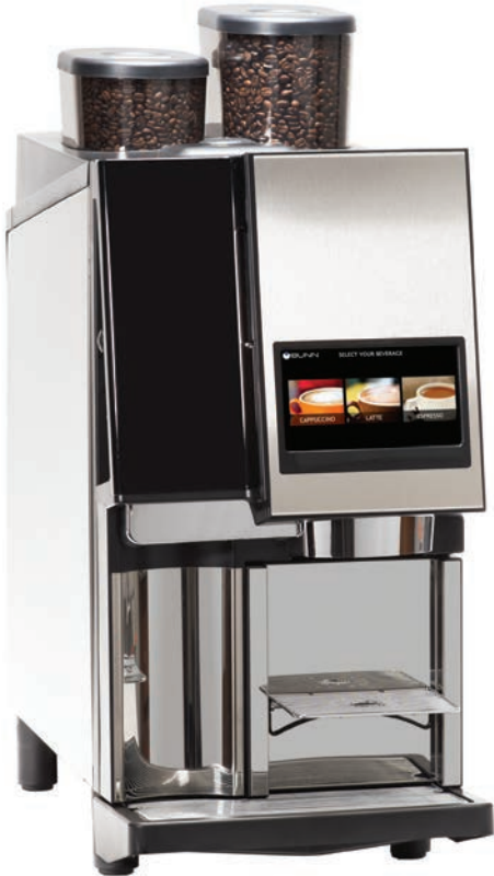
Sure Tamp® Auto