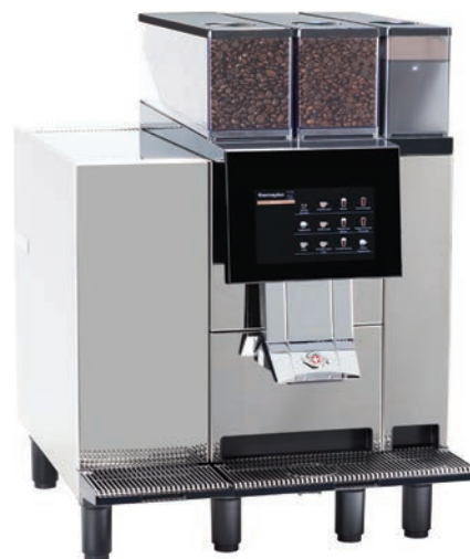
B&W4c CTM P RS