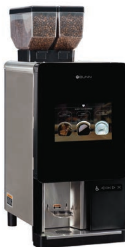
Sure Immersion® 220