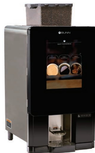
Sure Immersion® 312