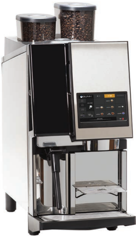
Sure Tamp® Steam

California residents see Prop 65 Warning on page 1