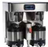
ICB TWIN TF PE with NEW TF Servers