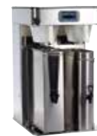
ITCB TWIN HV PE with Tea Servers