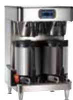
ICB TWIN SH PE with NEW SH Servers