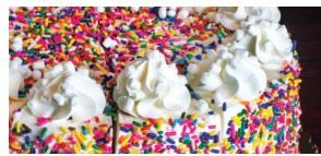
CELEBRATION CAKE | $65.00

Vanilla cake soaked with limoncello simple syrup, layers of cream cheese and lemon curd filling, iced with cream cheese frosting and topped with a meringue