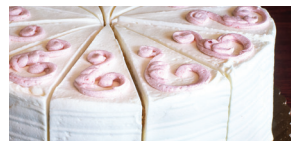
RASPBERRY ALMOND CAKE | $65.00

Sprinkle Cake layers with homemade pastry cream, iced with buttercream and covered in rainbow sprinkles