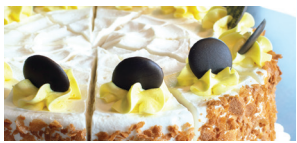
LEMON CAKE | $65.00

{10" Layer Cakes | Can be cut in 12 or 14 slices}