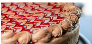
CHOCOLATE RASPBERRY SEDUCTION CAKE | $65.00

Chocolate cake with layers of chocolate mousse and chocolate ganache, covered in chocolate buttercream, chocolate ganache, and chocolate chips