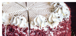
RED VELVET CAKE | $65.00

Chocolate cake with chocolate raspberry mousse layers, covered in chocolate buttercream