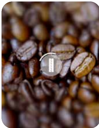
Full Screen Video Capabilities