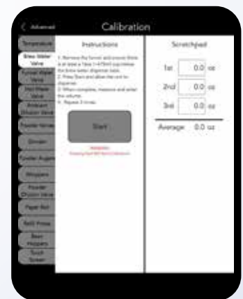
Picture Prompted Calibrations

*Examples above are shown on Model 312 17" touchscreen