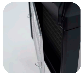
Magnetic air filter design provides easy removal and re-install for hassle-free maintenance.