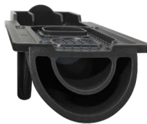
Optional faucet for dispensing chilled (non-frozen) product

The Ultra NX strengthens the already profitable and reliable Ultra equipment platform by offering enhanced design features that deliver a total cost of ownership reduction. The Ultra NX maximizes equipment uptime while providing easier equipment maintenance.