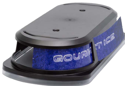
Slide-in hopper graphics allow for quick and easy changes

The new slide-in hopper graphics allow for quick and easy changes while the USB port provides easy software and setting updates as well as downloads.