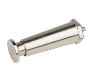
A robust leg redesign eliminates potential breakage when moving the unit.