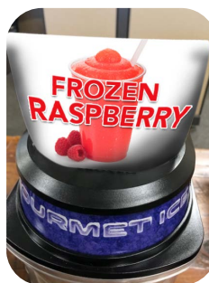
Hopper lid feature for point of purchase graphics