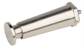
A robust leg redesign eliminates potential breakage when moving the unit.