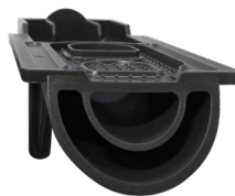
Optional faucet for dispensing chilled (non-frozen) product

An IoT machine management platform to communicate remotely with equipment to enable data backed decisions