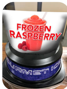
Hopper lid feature for point of purchase graphics