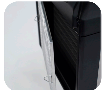
Magnetic air filter design provides easy removal and re-install for hassle-free maintenance.