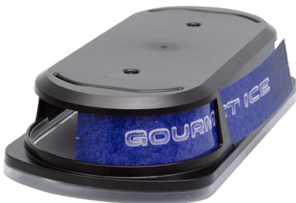
Slide-in hopper graphics allow for quick and easy changes