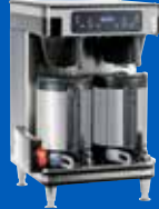
ICB Twin SH